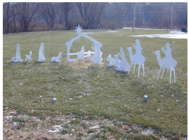
St. Margaret Mary Knights of Columbus Council 11091, 111 S. Hubbard St., Algonquin, IL 60102